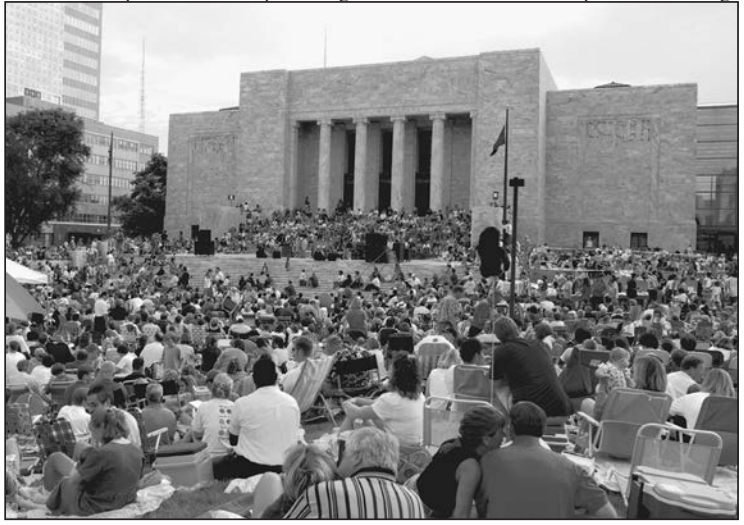
438 CREIGHTON UNIVERSITY UNDERGRADUATE BULLETIN

The course introduces students to the concepts, theories, and practice of school social work in the elementary, middle, and high school levels. An overview of the history and development of school social work is presented in lecture and interactive group discussions. Additionally, a field experience with a practicing school social worker is required and arranged by the