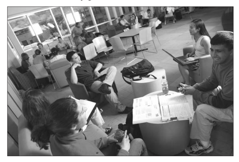
46 CREIGHTON UNIVERSITY UNDERGRADUATE BULLETIN

Students who have decided to withdraw from school and plan to return within the following year may wish to consider the Leave of Absence Program (LOAP). For further information about LOAP see page 43.