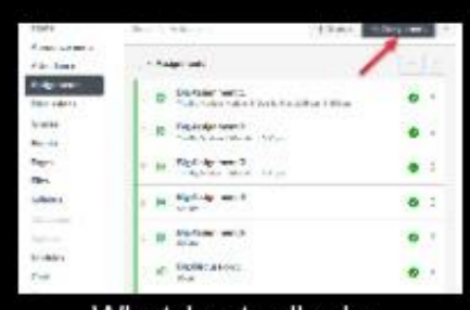
What I actually do.