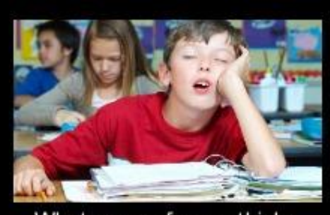
What my professor thinks I do.