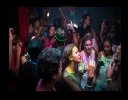
What my parents think I do.